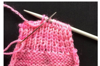
Wrong wide of stitch 4 pick up