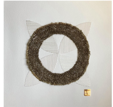
Combination of elements – knitted harakeke flax circle, silk yarn on paper, copper letters.