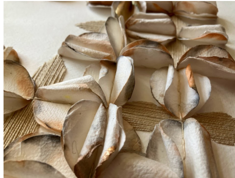
Detail of work made of handmade papers and hand spun silk yarn on watercolour paper.

If you will admit (like most fibre artists) to owning a collection of small fibre treasures, a stash of beautiful handmade papers, embroidery flosses and yarns or a stash of all of the previous and more, this is the workshop for you. Using an innovative system to create multimedia art works, participants will discover how to manipulate paper and combine materials into exciting and personal artworks.